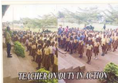
TEACHER ON DUTY IN ACTION