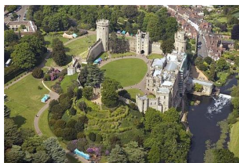
Aerial view of Warwick castle

To understand and use maps, globes, atlases, and geographical vocabulary.