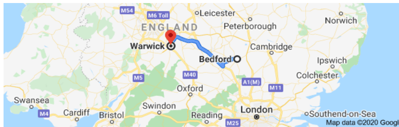
Route from Bedford to Warwick