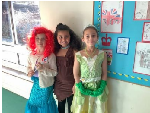
Colourful characters from Hazel class